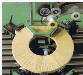
Copper Coil Packing Machine

The machinery is specialist for the packing process of slit steel coil, stainless steel coil, alloy coil...Trolley can be choose for loading&unloading. Automatic coil packing line is available too.