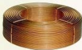
Copper coil wrapping machine

The copper coil packing machinery is ablet to covers a tight layer of film or paper over all surfaces of the coil. The coil can be with eye vertical or eye horizontal packing. Money save, high speed.