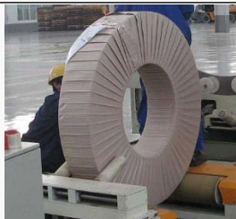
Steel Coil Packing Machine

The machinery is specialist for the packing process of slit steel coil, stainless steel coil, alloy coil...Trolley can be choose for loading&unloading. Automatic coil packing line is available too.