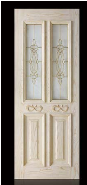
• With glass